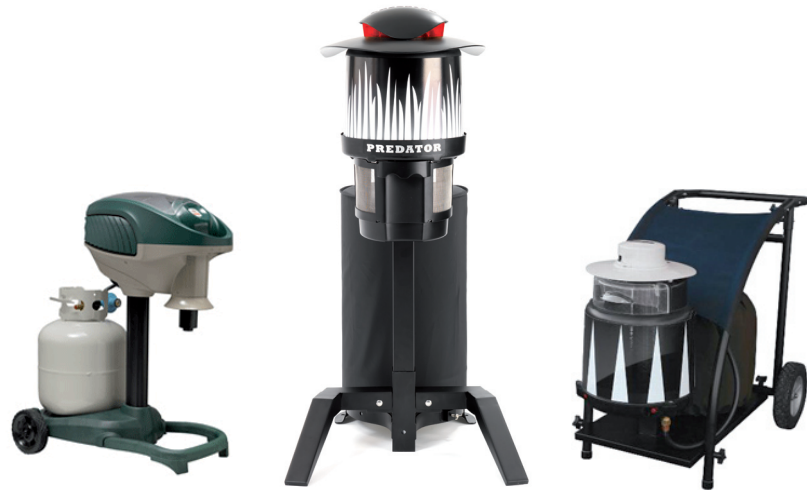
PRODUCT COMPARISON: Mosquito Magnet Liberty / Predator Dynamic / SkeeterVac 5100